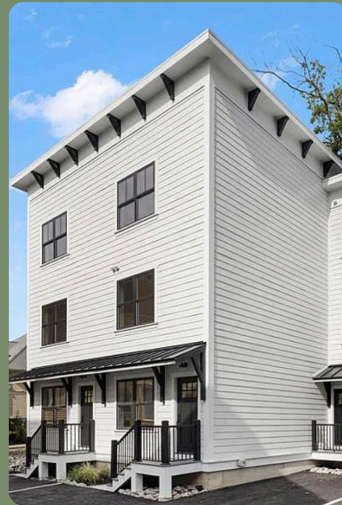
251 HOPE STREET